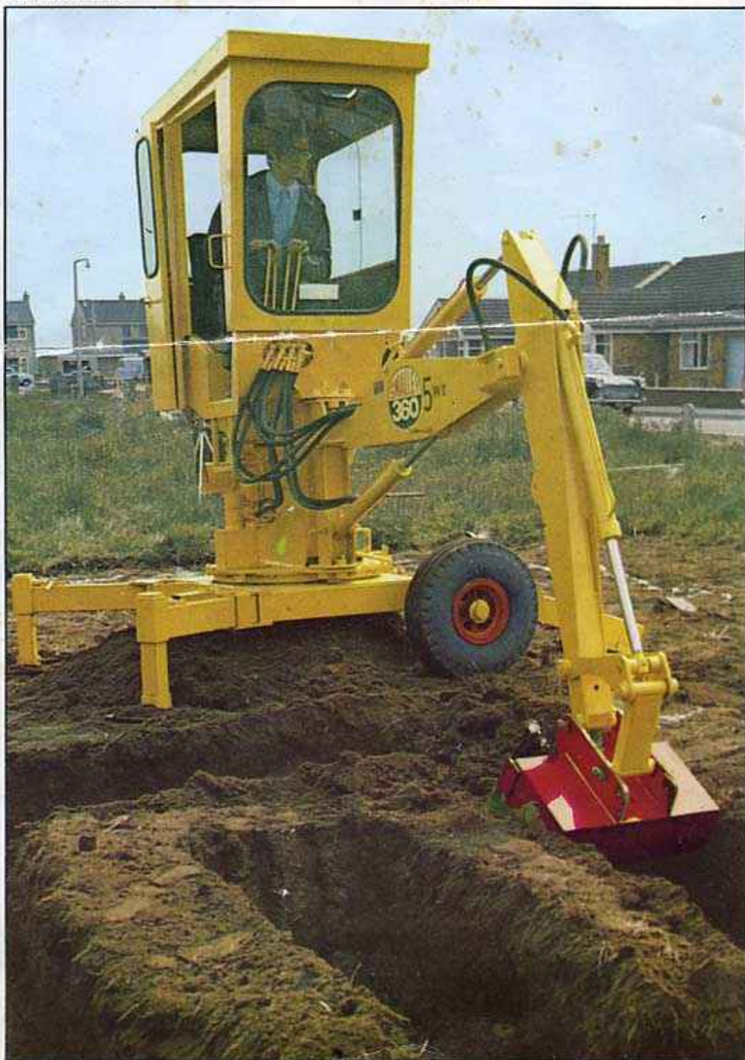
Complex house footings can be dug quickly, safely and neatly