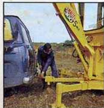
Detachable drawbar for towing

Ground conditions present no problem to the Smalley 360/5. With its unique action,