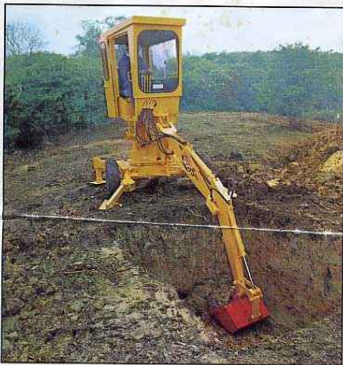
Bucket adjustment allows for square-hole digging to 8ft. depth

With a re-designed cab, the Mk. 2 gives much improved comfort and warmth to the driver, with complete all-round visibility. A complete range of quick-change accessories enables the Smalley 360/5 Mk. 2 to tackle virtually any job, quickly, efficiently and economically all the year round.