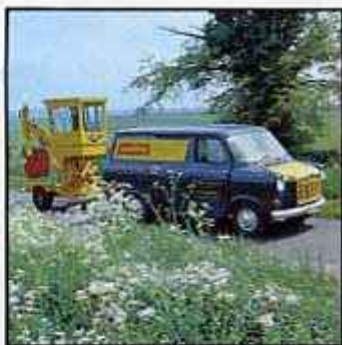
Easily towed to site

The Smalley 360/5 Mk. 2 must be the most versatile excavator on the market today, offering increased output with very considerable savings on capital and running costs. It can dig at the rate of 15 cubic yards per hour, on approximately a gallon of diesel fuel a day. Simply towed to the site by Land-Rover or van, the