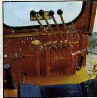
Controls layout in Mk. 2 Cab, with everything to hand.