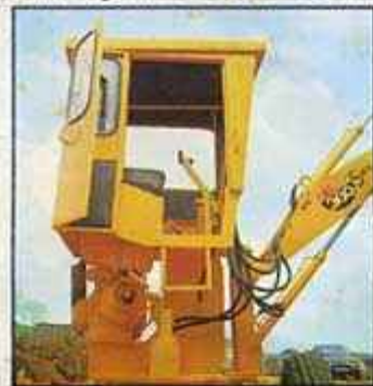
New cab design