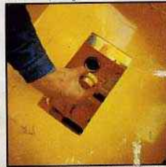
Easy access to fuel tank for filling