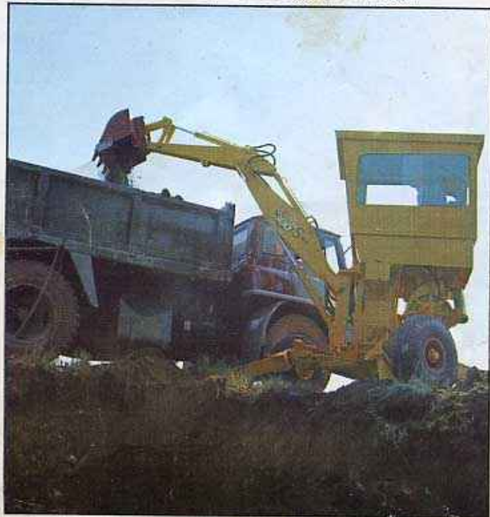
Off-loading into high-sided truck