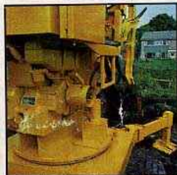
Engine layout permits good access for maintenance

Smalley Excavators are Guaranteed for Six Months