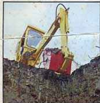
Working in heavy clay conditions