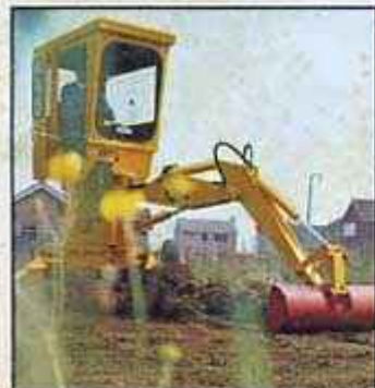
Skimming with 42" backfill bucket