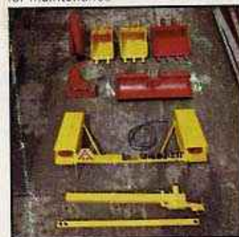
There is a wide selection of optional buckets and accessories