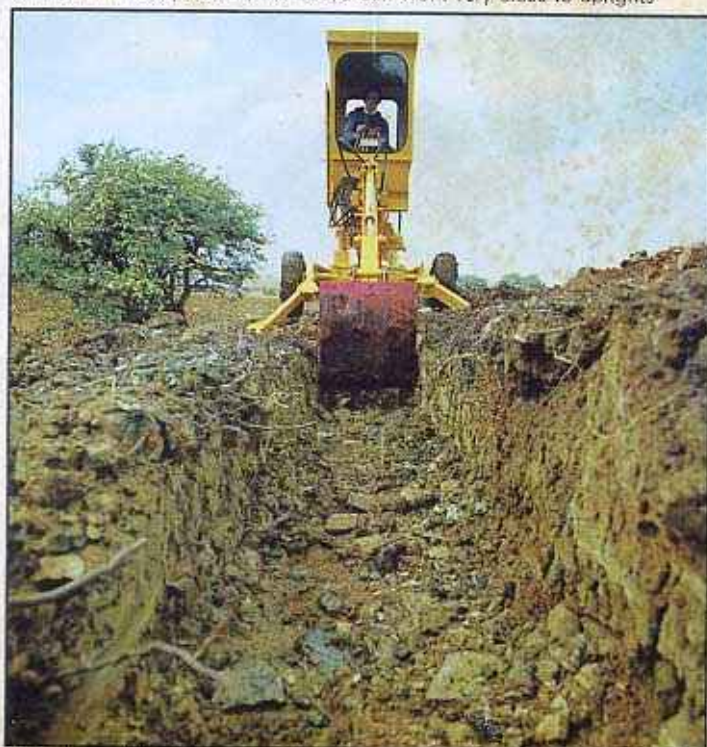
Vertical trench digging on a 20° bank using self-levelling adjustable stabilisers