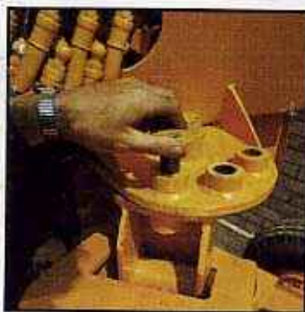
Ease of offset adjustment to jib

A new feature, unique to the 360/5, is the ability to switch the jib (in less than one minute) to an off-set position. This enables the excavator to operate safely and neatly in confined conditions (within 6 inches of walls), where its competitors could never go. The Smalley 360/5 just walks it.