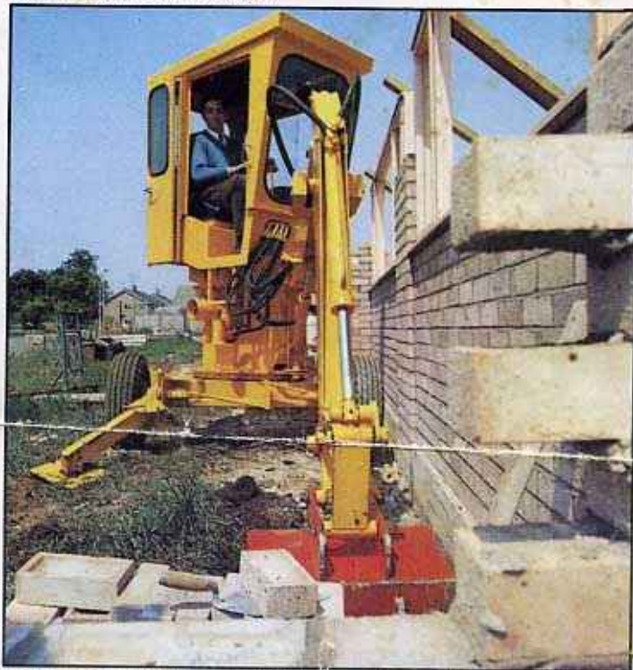
With jib in offset position, the 360/5 can work very close to uprights