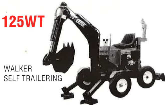
WALKER SELF TRAILERING