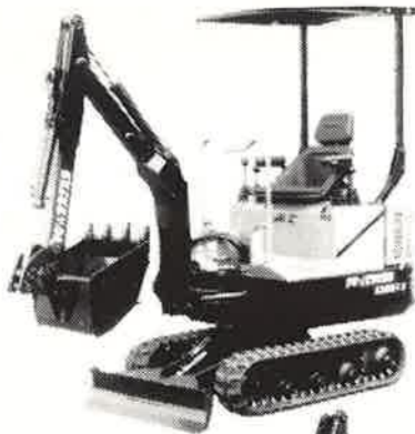
1700X 360° SLEW

1.2 to 1.7 TON DIGGING FORCE 2.3M (7'6") DEPTH OF DIG WIDTH FROM 0.7M (2'3½") to 1.0M (3'3½")