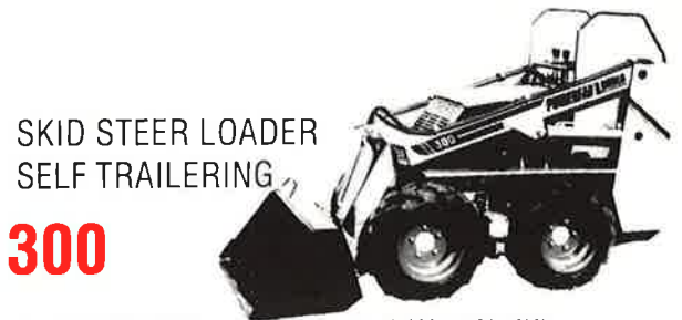
SKID STEER LOADER SELF TRAILERING

CAN BE FITTED TO 12 HP TO 40 HP TRACTORS