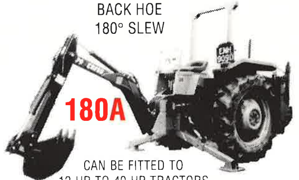
BACK HOE 180° SLEW