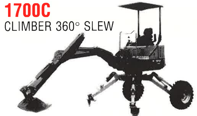
1700C CLIMBER 360° SLEW