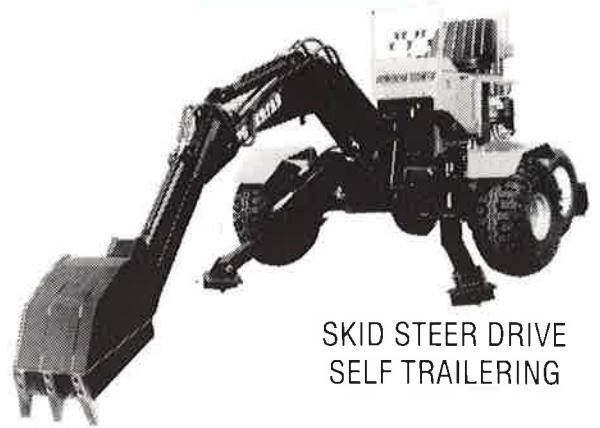
125WTD SKID STEER DRIVE SELF TRAILERING